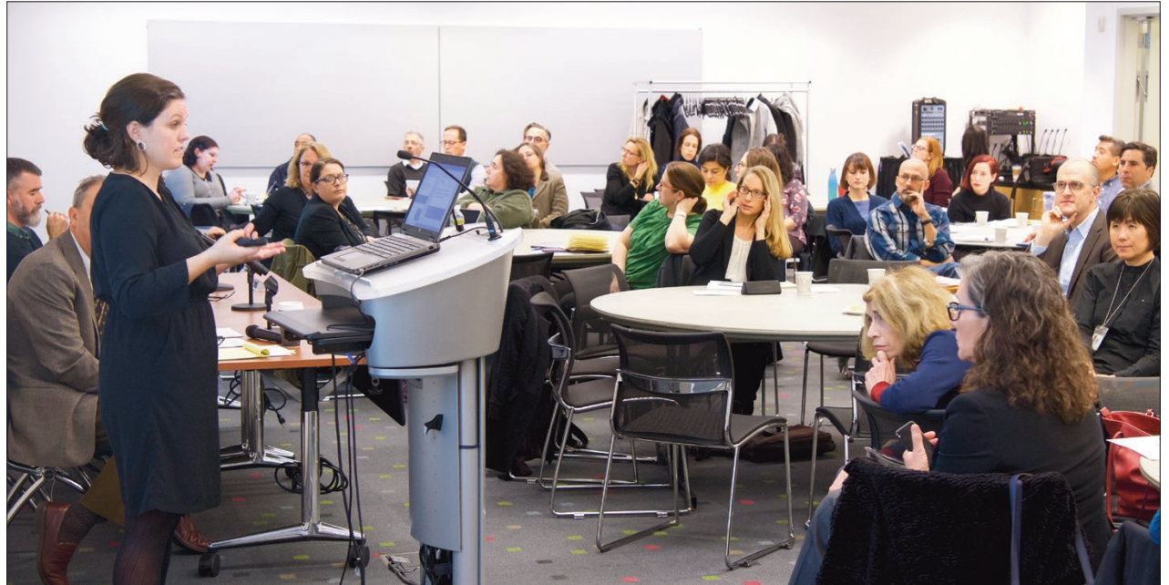
BMCC professors shared strategies for closing achievement gaps in reading and writing at CUNY English Summit.