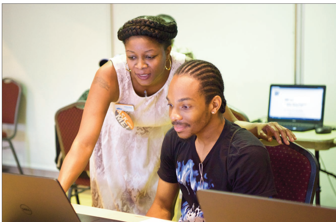
An enrollment management staff person guides a student through the admissions process at BMCC.

That process, grounded in BMCC’s Designing for Success initiative, focuses on every stage of student experience at BMCC—from enrollment to graduation and transfer to a four-year school or