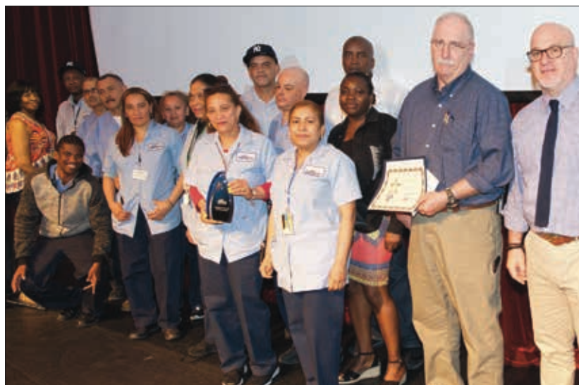
Buildings and Grounds staff, winner of Team Achievement Award.

and Particle Physics Prize at the European Physical Society Conference on High Energy Physics in Ghent, Belgium for their discovery, in the 1990s, of a top quark, or subatomic particle.