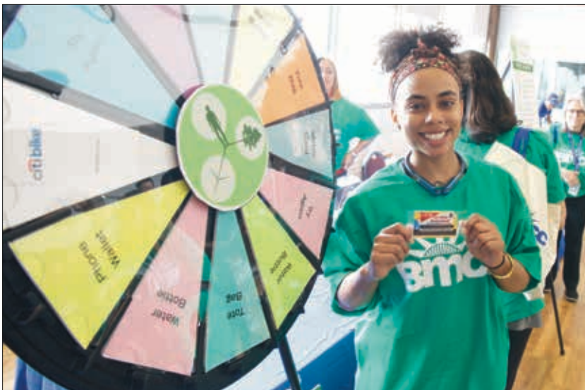
The BMCC Sustainability Fair, on April 17, featured information booths and activities.