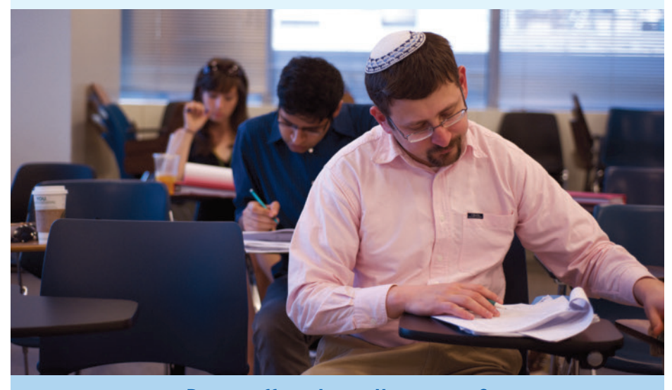
Do you offer other online courses? Yes, visit our website: www.bmcc.cuny.edu/ce and click on ONLINE COURSES.

This course provides an overview of law school entrance procedures, a career in law, and law school survival techniques. It includes an intensive review of reading comprehension and logical reasoning questions, including techniques for quick elimination of incorrect answers, and practice on actual LSAT exams from previous years.