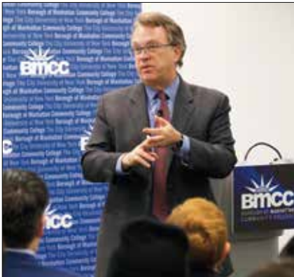
(L) BMCC team wins College Fed Challenge; (R) John C. Williams, President and CEO, Federal Reserve Bank of New York speaks at BMCC.