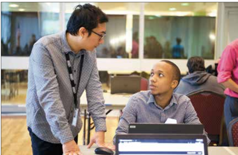
A representative from the U.S. Census Bureau discusses upcoming opportunities with a student.

On October 22, BMCC students filled Richard Harris Terrace at 199 Chambers Street for a 2020 U.S. Census information and job recruiting session. Census Bureau Representatives met with students on how to apply for temporary jobs as census takers as well as clerical and other positions. BMCC’s census campaign is part of a larger effort between CUNY, the New York City