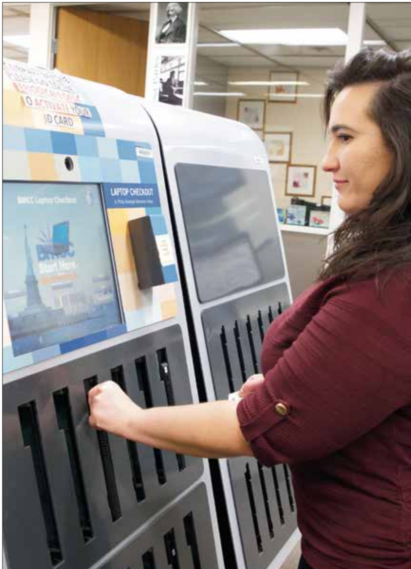
Using their BMCC ID, students can check out laptops from kiosks in the college library.