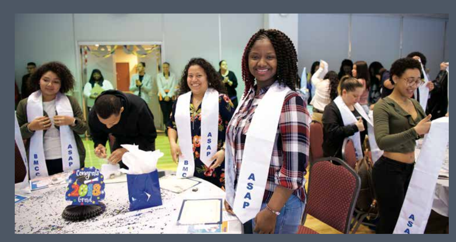
BMCC's ASAP program is the largest in CUNY, serving nearly 6,000 students, about 25% of all BMCC students. BMCC ASAP continues to have graduation rates approximately twice as high as a comparable cohort.

Or, call the Office for Institutional Advancement at (212) 220-8020.