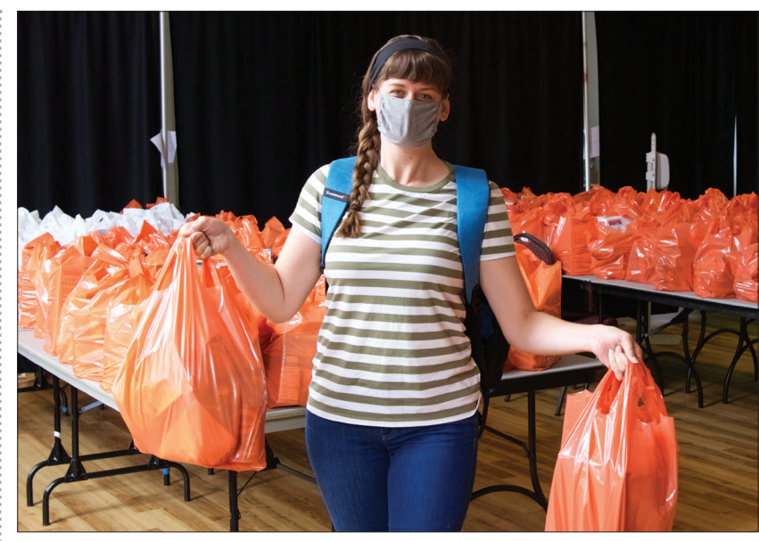
MacKenzie Scott's gift will enable BMCC to scale up efforts addressing food insecurity.

BMCC is also known for its agile approach to building student success,