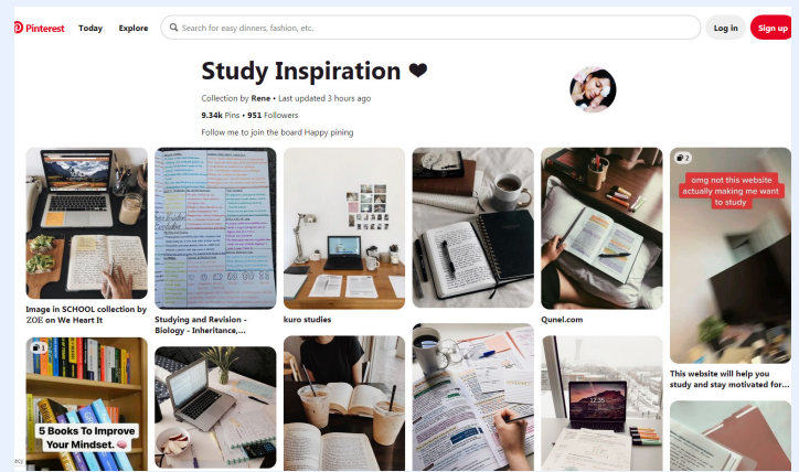
A collection of "study inspiration" images on Pinterest

collected. Writing components come into play as integral part to boost both higher-order critical thinking and writing skills. To each collected item, the student adds a caption as well as tags for easier categorization, and provides a longer curatorial statement (2-3 pages, double-spaced) to explain the overarching idea or frame of their collection, just as we see small placards of item description and longer guides at the starting point of the museum exhibition. Because the digital collection is open to the public, the student is asked to take into account outside viewers, and think rhetorically—be alert to the genre, purpose, and audiences of their writing.