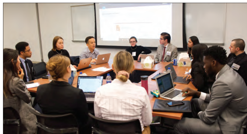
Student cohorts gain insight from industry professionals in a variety of fields.

BNY Mellon is known for its pivotal work in software development,