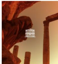
SUMMER MIDDLE EAST STUDIES AMMAN, JORDAN