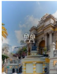
SUMMER IN SANTIAGO SANTIAGO, CHILE