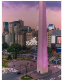
SUMMER IN BUENOS AIRES BUENOS AIRES, ARGENTINA

Select to Compare Select to Compare Select to Compare