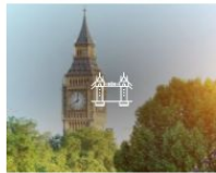
SUMMER IN LONDON LONDON, ENGLAND