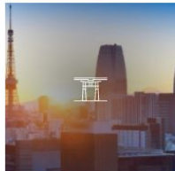
SUMMER JAPANESE STUDIES TOKYO, JAPAN