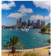
SUMMER IN SYDNEY SYDNEY, AUSTRALIA