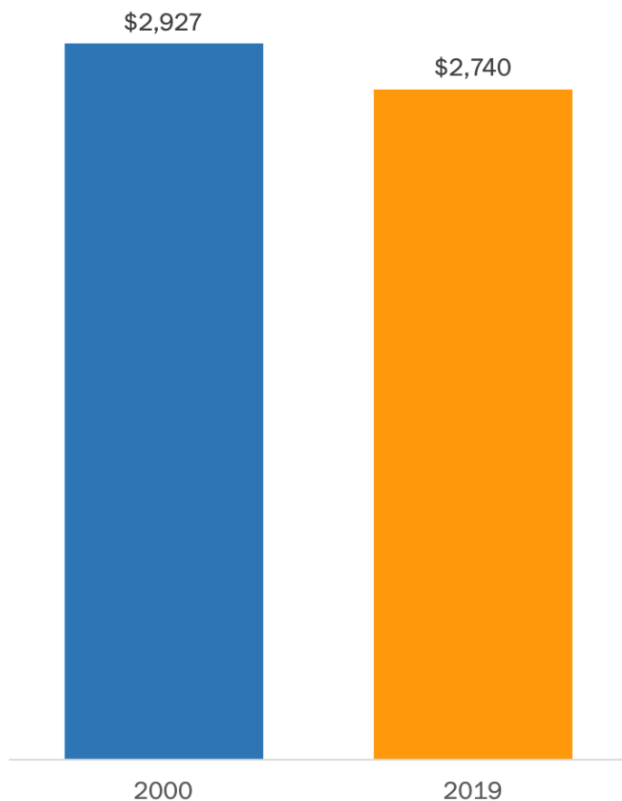
Per-Student Baseline State Funding for CUNY Community Colleges Has Stagnated