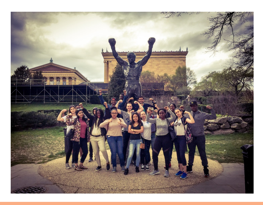
Students flexing in front of the famous "Rocky" statue at the foot of the famous steps!

After they met the mayor, scholars walked through the museum, climbed into the gazebos overlooking the Schuylkill Falls, and walked along the historic Water Works, admiring its old school beauty. They then hopped back on the bus and ventured to South Philly, where they were dropped off along the historic and culturally diverse Italian Market. They took in all of the sights, sounds, and smells of this rich urban outdoor marketplace and walked towards the original Philly cheesesteak birthplace! For lunch, they had the original Philly cheesesteaks, which lived up to their fabulous reputation!