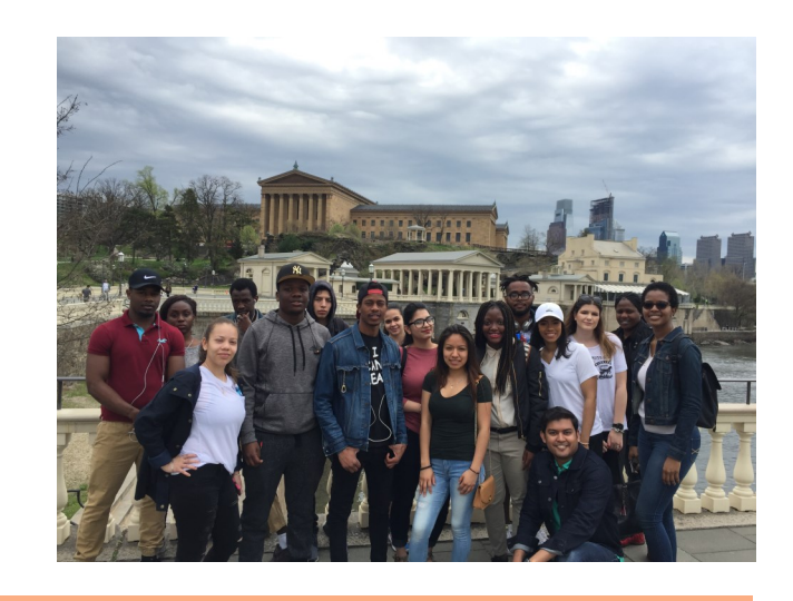
Above: At the Philadelphia Waterworks; Below: at Rutgers—Camden.

After they met the mayor, scholars walked through the museum, climbed into the gazebos overlooking the Schuylkill Falls, and walked along the historic Water Works, admiring its old school beauty. They then hopped back on the bus and ventured to South Philly, where they were dropped off along the historic and culturally diverse Italian Market. They took in all of the sights, sounds, and smells of this rich urban outdoor marketplace and walked towards the original Philly cheesesteak birthplace! For lunch, they had the original Philly cheesesteaks, which lived up to their fabulous reputation!