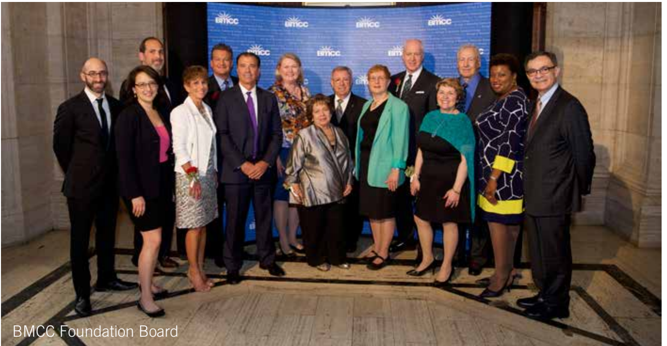
BMCC Foundation Board