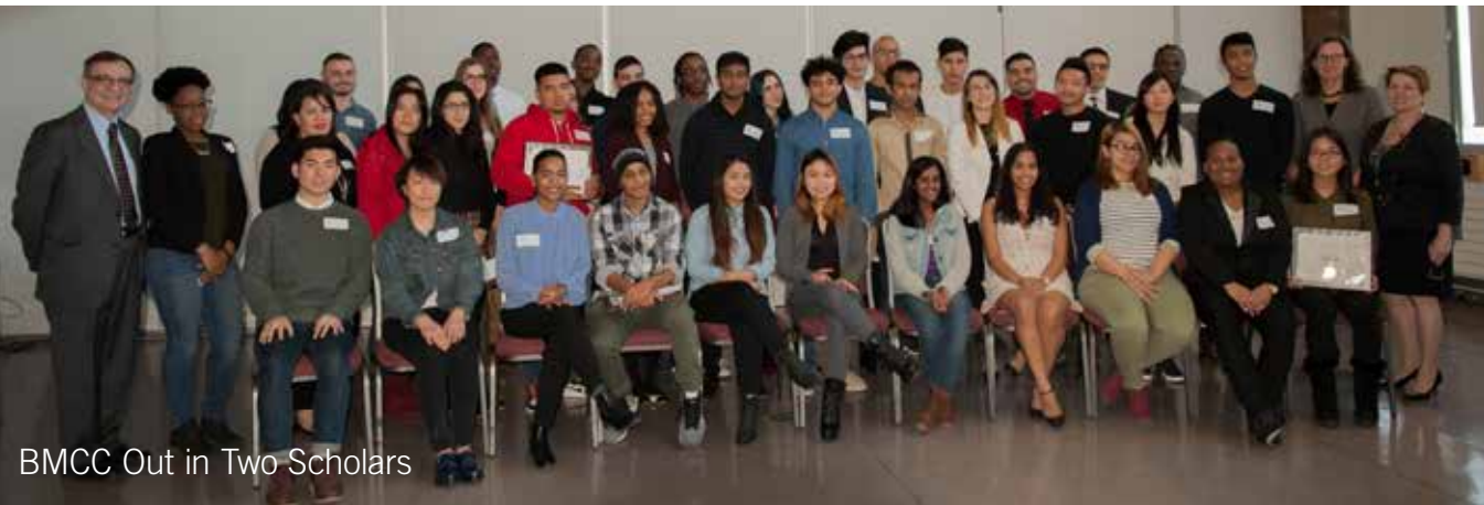
BMCC Out in Two Scholars