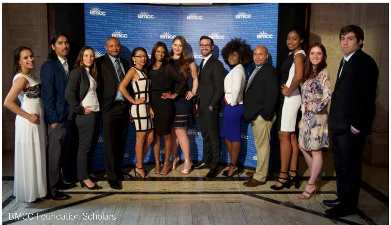
BMCC Foundation Scholars

Thanks to funds raised at our Gala and through other efforts, the BMCC Foundation awards approximately 350 scholarships each year. These scholarships help students succeed in achieving their associate degrees.