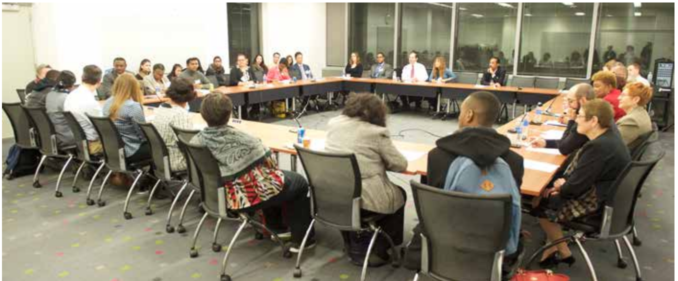
BMCC Alumni Council

To be placed on the alumni email list and learn of upcoming events, contact alumni@bmcc.cuny.edu . Join other BMCC Alumni on Facebook and LinkedIn by visiting www.bmcc.cuny.edu/alumni .