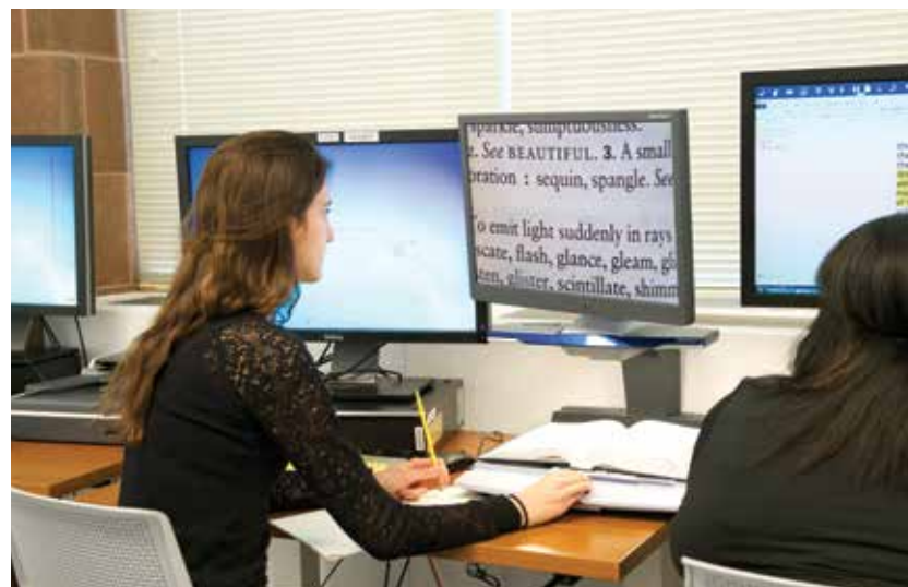
Accessibility at BMCC is provided through online courses and assistive software.