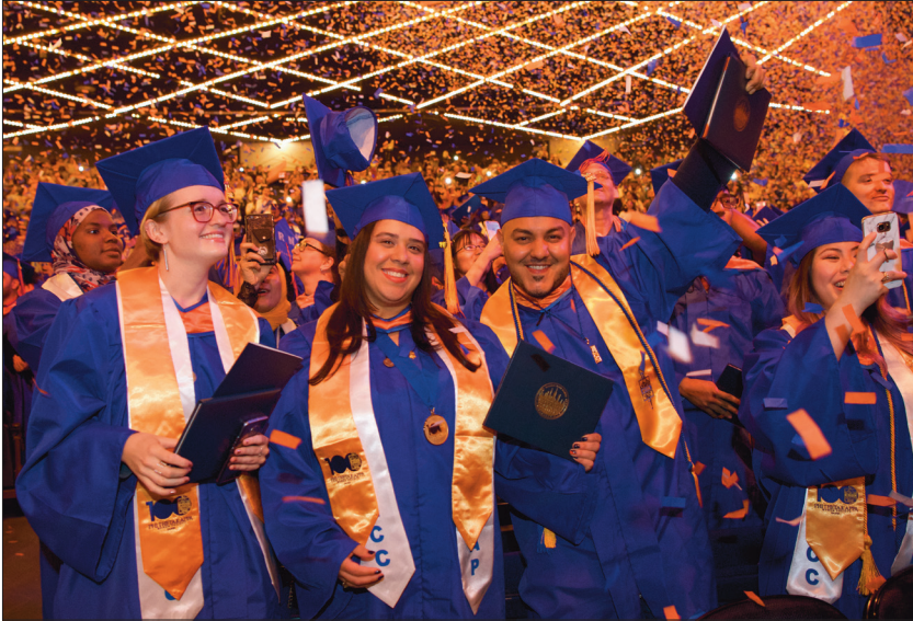
Six months after graduation, 65% of BMCC graduates are enrolled in further education.

In Fall 2017, BMCC was selected to join the second cohort of the Guided Pathways Initiative (2.0) supported by the American Association of Community Colleges (AACC) and other national organizations. A college-wide Design Team at BMCC has been charged with engaging faculty, staff and students in the project, Guided Pathways: Designing for Success , which seeks to improve rates of college completion and transfer, prepare students for careers that yield family-sustaining wages and achieve equity in those outcomes.