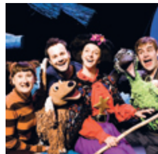
▲ Room on the Broom

● Charlotte’s Web. E.B. White’s childhood classic story of Wilbur, a pig, and Charlotte, the spider, is told on