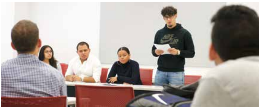
Speech 100 students present their propositions in classroom debate.